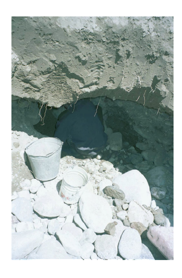
Figure 4. Small scale miner digging into loose gravel

sieved and the coarse grained gold is recovered in a sluice (Fig. 4). In some areas the small-scale miners add a copper plate coated by mercury at the end of the sluice in order to catch finer grained gold. Instead of the mercury coated copper plate many small-scale miners use amalgamation. They add mercury to the heavy mineral concentrate from the sluice. Gold is dissolved in the mercury. The miners subsequently burn off the mercury and the gold is recovered. This is a very toxic process. One miner told that he used a mask to protect himself against the mercury vapour. This will save him during the process of amalgamation, but his wife, children and him will gradually be poisoned when the mercury enters the drainage system. For further details see chapter on health.