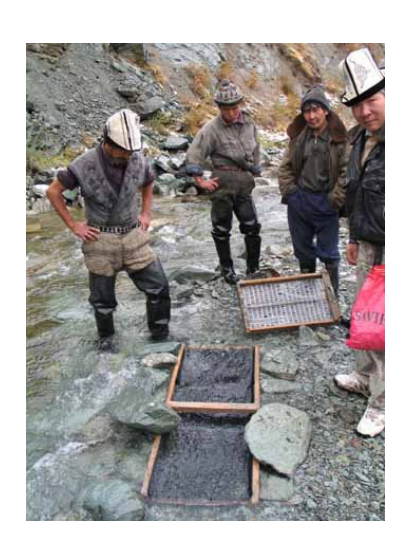
Figure 5. Sieve and sluice