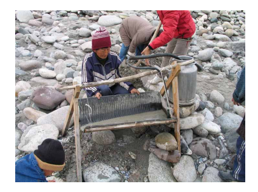
Figure 2. En route to Sary-Jaz